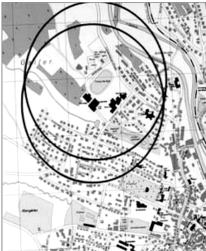
Fig. 1: Schematic plan of the antenna sites

The GSM transmitter antenna has a power of 15 dBW per channel in the 935MHz frequency range. The total